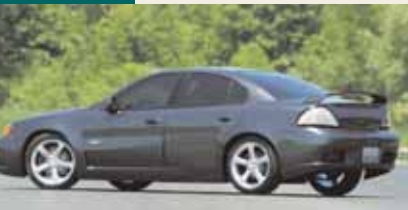
Pontiac Grand Am