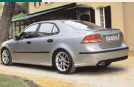
Saab 9-3 Sport Sedan