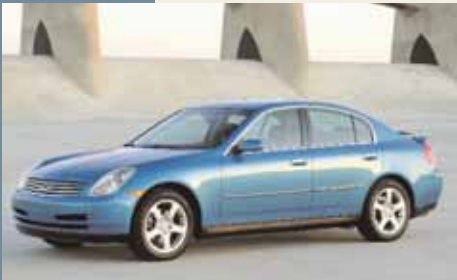
Infiniti G35 Sport Sedan