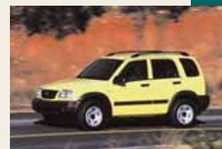
Suzuki Vitara V6

*Stop towing after 200 miles and follow the manufacturer's instructions to circulate the oil in the transfer case and/or transmission.