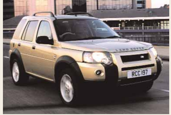
Land Rover Freelander