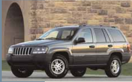
Jeep Grand Cherokee