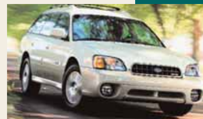
Subaru Outback Wagon