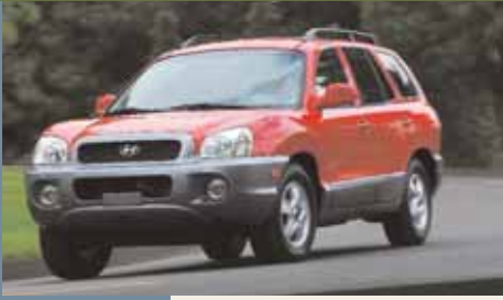
Hyundai Santa Fe